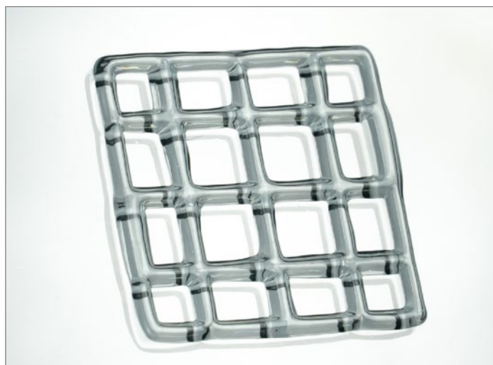
Figure 2. Three-layered grid structures acquired after printing with Corning Start sacrificial ink using the parameters from Table 2.